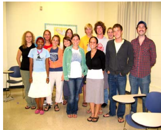
These are students from all levels of education, studies, and interests.