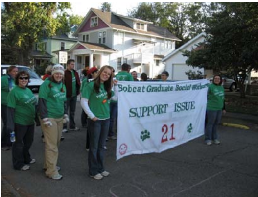
Cheering Social Work students upholding the banner for supporting the 317 Board on Issue 21

The 317 Board is the local Alcohol, Drug Addiction and Mental Health Services Board which serves Athens, Hocking, and Vinton Counties. The board provides a network of care for people who need prevention and treatment of mental illness and/or alcohol and drug addiction. The 317 Board's role is to design policies, evaluate programs, access funds and monitor services for those seeking help. In order to do this the Board receives state and federal funding from the Ohio Department of Mental Health and the Ohio Department of Alcohol and Drug Addiction Services, as well as funding from local tax levies passed by the citizens of Athens, Hocking and Vinton Counties.